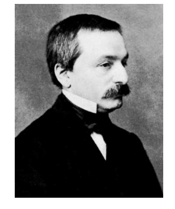
Figure 1: Georg Cantor (1845 – 1918)